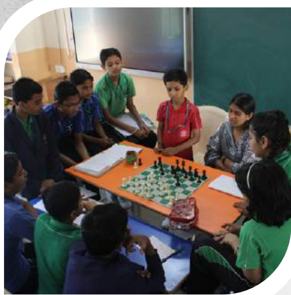
SUMMER CAMP 2023-24