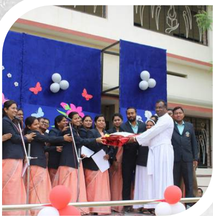
FESTAL GREETINGS TO THE PRINCIPAL