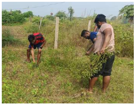
Service in a Village